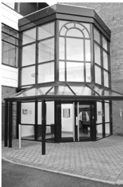
Front door to the building - buzz the intercom to be let in.