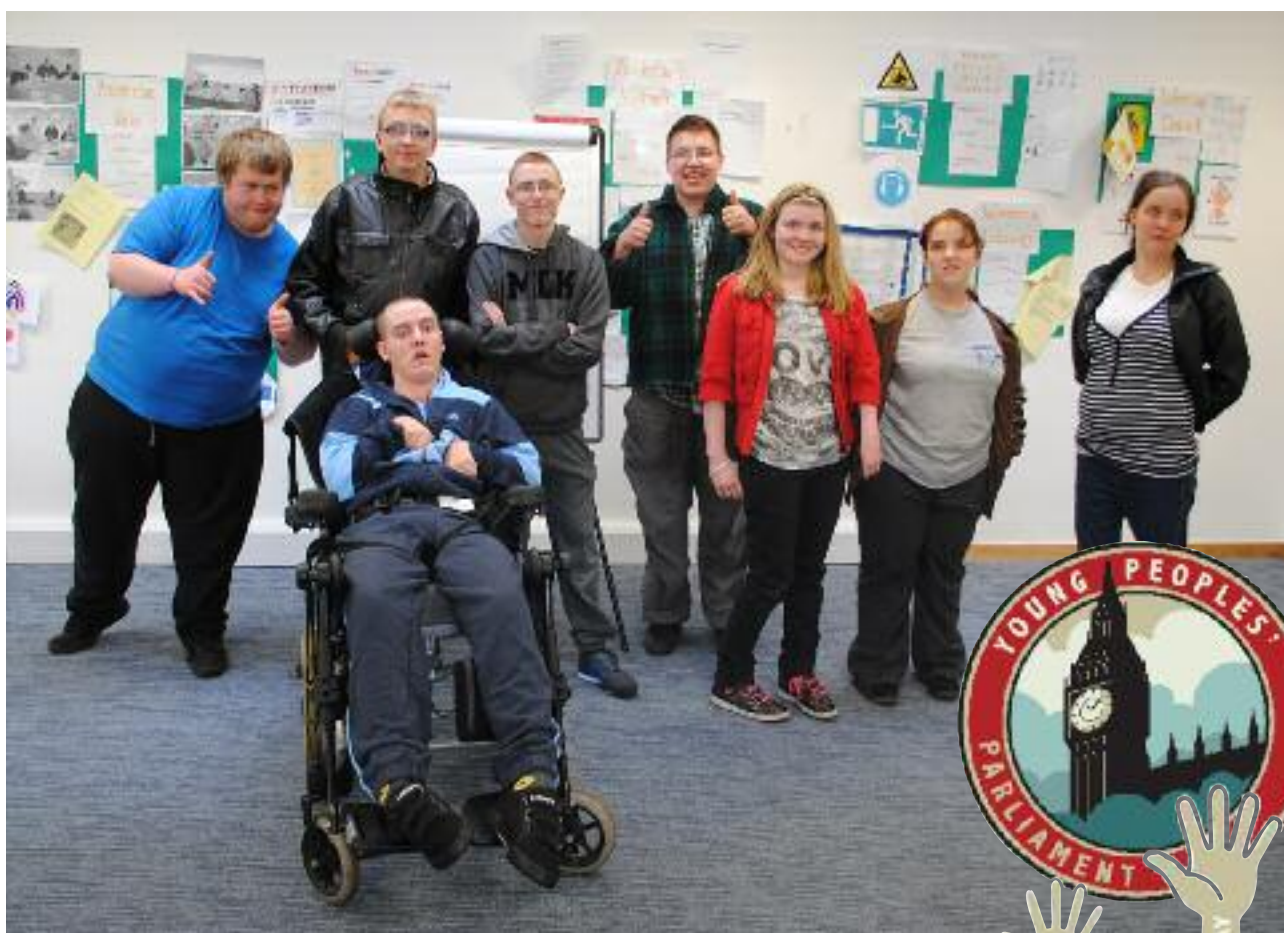
Some of our new MPs